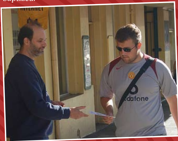
Names of many people we meet are changed to protect privacy.